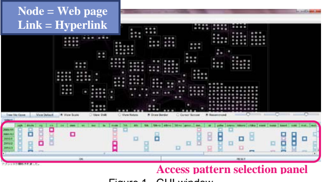
Figure 1. GUI window

Access patterns extracted by the technique described in Section 3.1 are placed as colored buttons on a GUI screen, as shown in Figure 1. When a user selects interested patterns, this technique paints nodes contained in the selected patterns. Moreover, buttons are colored according to five levels, determined based on the number of average accesses in the access patterns. This coloring system works as an access pattern recommendation function.